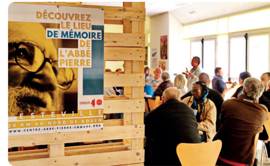
EUROPE | Emmaus Europe Training Session on the History and Values of the Movement