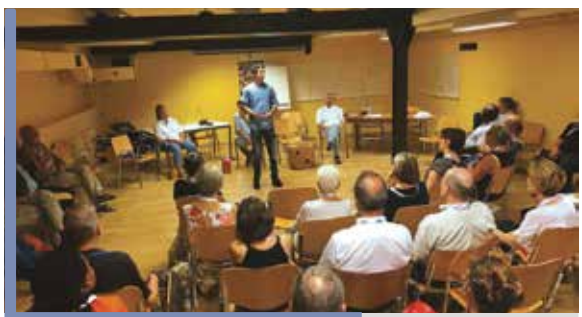
The emphasis was on group work carried out during 21 workshops.

During the World Assembly in 2016, the representatives decided that Emmaus International would organise the first "World Forum of Alternatives led with the most excluded" in Geneva, from 17 to 20 September 2018, together with social movements who joined us from around the world. 418 activists and volunteers originating from over 30 countries gathered for 4 days to establish common struggles against the structural causes of poverty and to work together to develop alternatives for a fairer world. These days together were structured around workshops to create initiatives, plenary sessions, conferences, and a cultural day to relax and give the participants a chance to interact with the local population in Geneva.