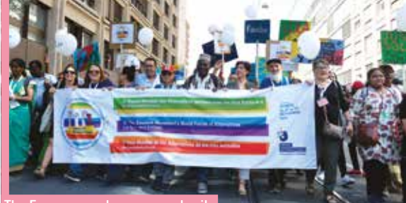
The Forum was also an opportunity to lobby and demonstrate.

The 21 workshops enabled us to identify the common structural causes for each issue presented in the workshops, along with opportunities to combat these. This Forum resulted in the drafting of 38 initiative proposals, categorised into three key modes of action: popular education and training of actors on the ground; identifying and rolling out pilot initiatives that already exist; lobbying of public decision-makers.