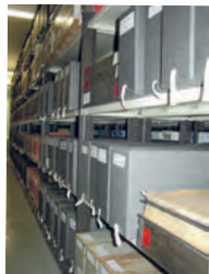
Thousands of archives still to be processed.

“A little gesture or small act is worth much more than a big, beautiful dream that never becomes a reality. It’s by taking action that we’ll change things for the better. That’s what solidarity is really all about.”