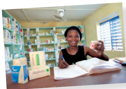
Access to healthcare for the most excluded members of society. Healthcare in Benin, India and Burkina Faso. Emmaus Pag-la-Yiri - Burkina Faso