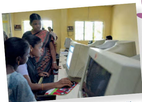
Training sessions in order to fight inequality. Tara projects - India