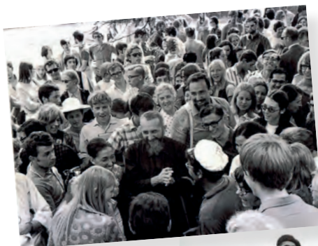
Denmark - 1963