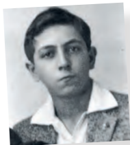
Abbé Pierre aged 15.

Bringing to life what we have inherited from Abbé Pierre by promoting his archives.