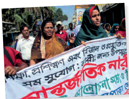
Know your rights in order to defend them. Emmaus Thanapara - Bangladesh

S ince the creation of Emmaus International, one of our guiding principles inspired by Abbé Pierre has been to live out solidarity as a political engagement. In this way, since its very beginnings, Emmaus International has been contributing towards structural change in our societies, helping in the struggle “until the cause of each ill is eliminated” and defending “access to fundamental rights for all”. (The Universal Manifesto of Emmaus, 1969).