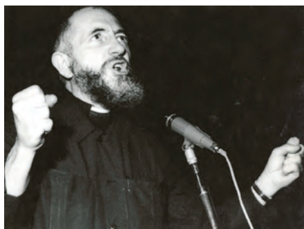
The “voice of the voiceless”. Beirut - 1959

“It is not enough to act, we must conquer - defeat the forces pushing against us”.