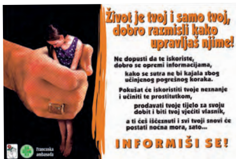
Leading an awareness raising campaign and denouncing human trafficking. Emmaus IFS - Bosnia