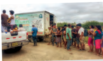
Assistance for flood victims. Emmaus Piura - Peru

For a quick and efficient response to urgent situations