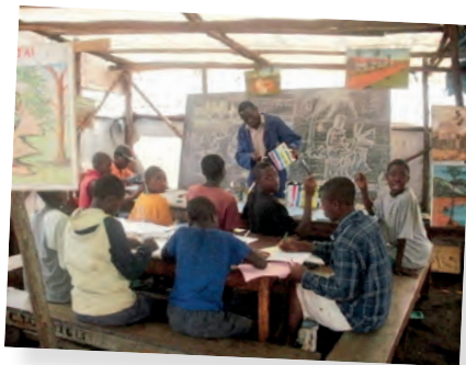
Support for former child soldiers to help them build a future. Emmaus CAJED - DR Congo