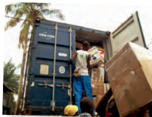
Unloading. Emmaus Jekawili - Côte d'Ivoire