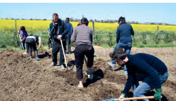
The soil, a commonly-held resource, to share and protect. Emmaus Toulouse - France