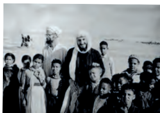
Sahara - 1962

A tireless freedom fighter. Burkina Faso - 2003