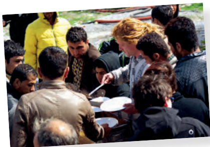
Moral, logistical, legal and political support for migrants. Calais - France