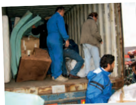
Loading. Emmaus Angoulême - France

Solidarity through the sharing of resources – materials collected in Western Europe are then sent to Latin America, Africa and Eastern Europe to be sold there.