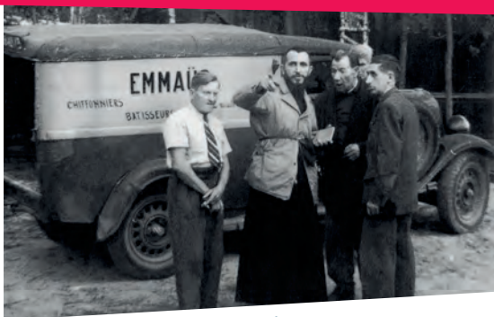
Abbé Pierre and the first companions. France - 1953

Confronted with entrenched poverty in France and the authorities' lack of concern, Abbé Pierre launched his renowned appeal of 1 February 1954, which had a global impact.