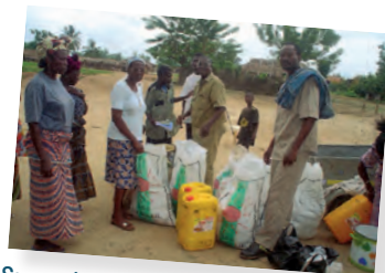
Support for foreign refugees. Emmaus Mars NGO - Togo