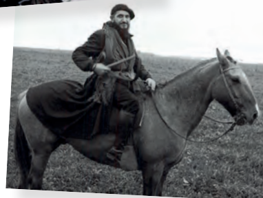
Argentina - 1959